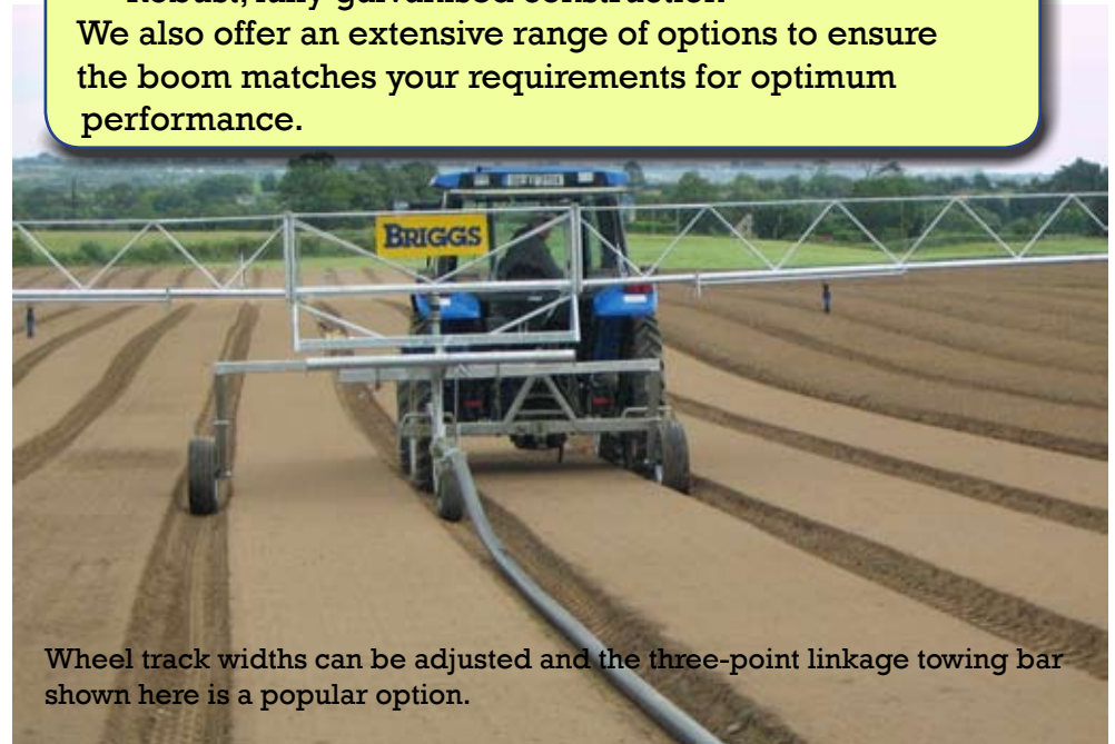
Wheel track widths can be adjusted and the three-point linkage towing bar shown here is a popular option.

We also offer an extensive range of options to ensure the boom matches your requirements for optimum performance.