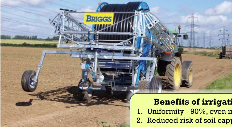
Mounted booms fold securely on the reel, simplifying transport and setting up.