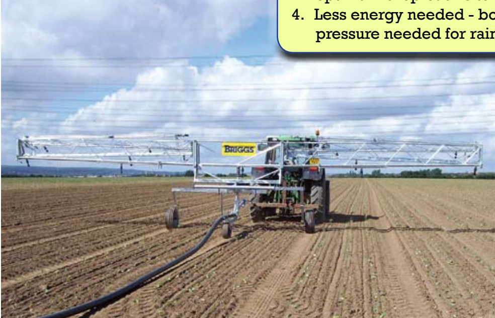
R40 pulling out.