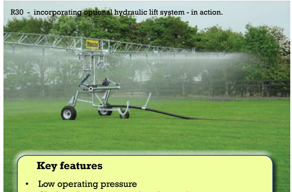
R30 - incorporating optional hydraulic lift system - in action.