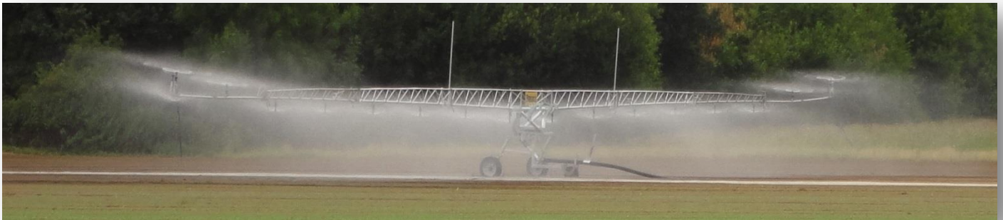
CHART SHOWING LANE SPACING BETWEEN RUNS (M) AND PRESSURE REQUIREMENTS ON THE BOOM (BAR)