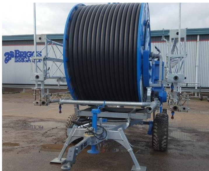
R46/46 IN TRANSPORT POSITION